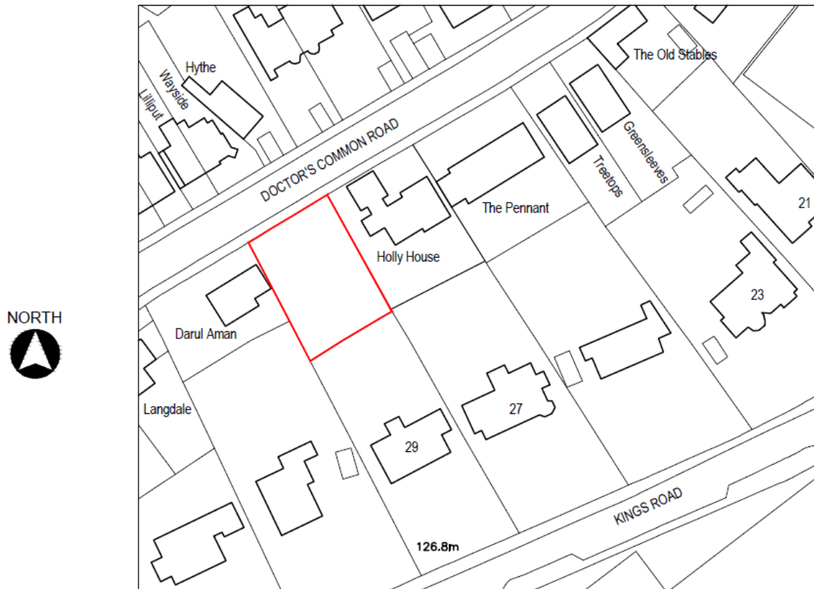
1:1250 SITE LOCATION PLAN

LAND ADJ HOLLY HOUSE, DOCTORS COMMONS ROAD, BERKHAMSTED, HP4 3DR